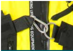
Connect and extract

The lifting becket is useful when extracting the wearer from the water. The buddy line provides extra safety by letting crew members stay close together while waiting for evacuation. If not in use, the carabiners can be stored behind the name-tag.