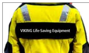
Print on back

3-finger 1 mm Neoprene gloves. Attached to the wrist by a strap and easily stored in slim fit sleeve pockets. Separate 5-finger Neoprene work gloves available.