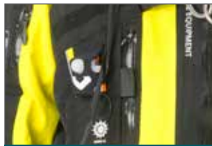
Light and whistle

High-wear spots such as the knees and seat area are reinforced with extremely durable Dupont™ Kevlar®.