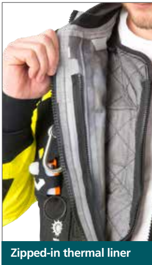
Zippered-in thermal liner

A choice of zip-up thermal linings with integrated buoyancy foam and great moisture-management abilities make the suits ideal for both cold and warmer climates. Easily removed for cleaning and replacement.