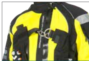
Zipper and collar

The 1 mm flexible watertight Neoprene cuffs ensure easy donning and optimal comfort during extended wear.